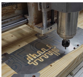
CNC routing the antenna reflectors and deflectors I designed

The antennas are based on a generic Yagi-Uda design found around my house. The dimensions are modified to perform well within the desired frequency range. The director and reflector elements were cut from 1/16th inch aluminum and the driver is a custom PCB. The antennas are attached using a 3D printed mount to a soup can waveguide to stop crosstalk. I also have not profiled these antennas for the reasons mentioned above, but from the cursory tests I have done on the radar, they seem to work alright.